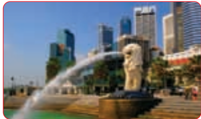
Trips to Dubai & Singapore