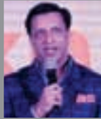
Mr Madhur Bhandarkar (Director, Writer & Producer)