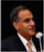
Mr Richard R Verma (Former US Ambassador to India)