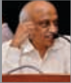
Mr AS Kiran Kumar (Former Chairman, ISRO)